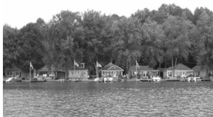
Homes on the shoreline of Buckeye Lake