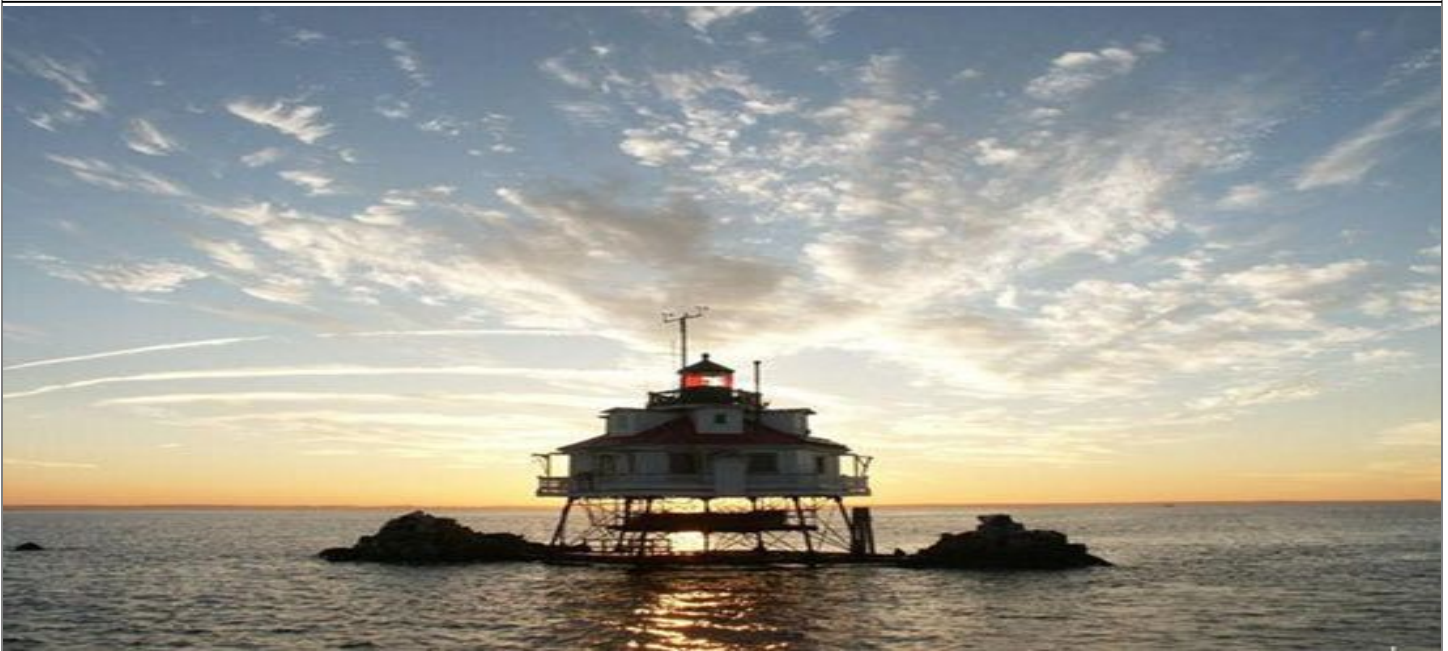
Buckeye Lake Yacht Club omitted from the plans for the new dam